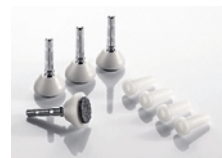
Set of glides Art. 2015