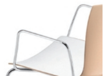
Armrests BV brushed stainless steel