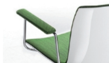
Armrests CI - only pad