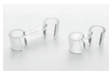
Movable link Art. 2073