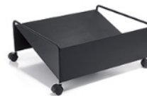
Trolley Art. 0760