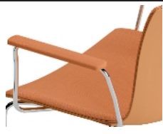
Armrests CI - only pad