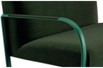
Armrests CI - only pad