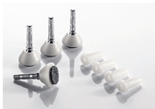
Set of glides Art. 2015