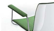
Armrests CI - only pad