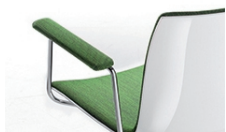
Armrests CI - only pad