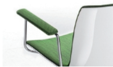
Armrests CI - only pad