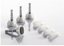
Set of glides Art. 2015