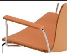
Armrests CI - only pad