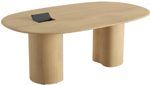
Table with a double base and oval top (1" thick) in a version fitted with side cable grommet and removable flap. Bases and top made of oak-veneered MDF, available in a single-colour combination. Flap is available in the same finish as the top: woodgrain continuity between the door veneer and the top veneer is not guaranteed. Height 29 1/4".