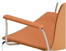
Armrests CI - only pad