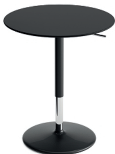
Table with round powdercoated metal base and MDF round top (Thick 1/2") equipped with gas-lift mechanism for height adjustment. Base and top are available in 2 different colors.