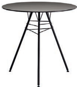
Table with steel base and top made of solid core HPL, available in the round or triangular with rounded edges versions. Powder-coated base available in white, moka and green, while top is only available in dark grey (Thick 1,30 cm). Suitable for outdoor use. Height cm 74. Collection includes coordinated chairs. (Leaf Chair, Pricelist I)