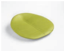
Cushion - Outdoor Art. 1807