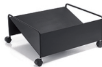
Trolley Art. 0760