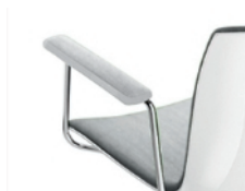
Armrests CV - pad (only for PO)