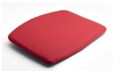
Cushion Art. 0261