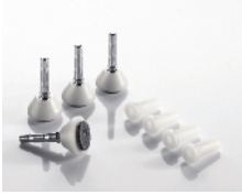
Set of glides Art. 2015