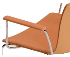
Armrests CI - only pad