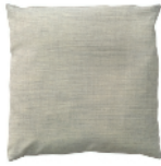
Pillow 45x45 cm Art. 5268